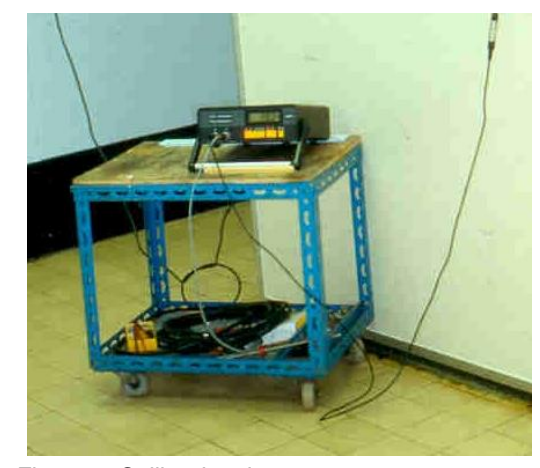
Figure 1: Calibration thermometer